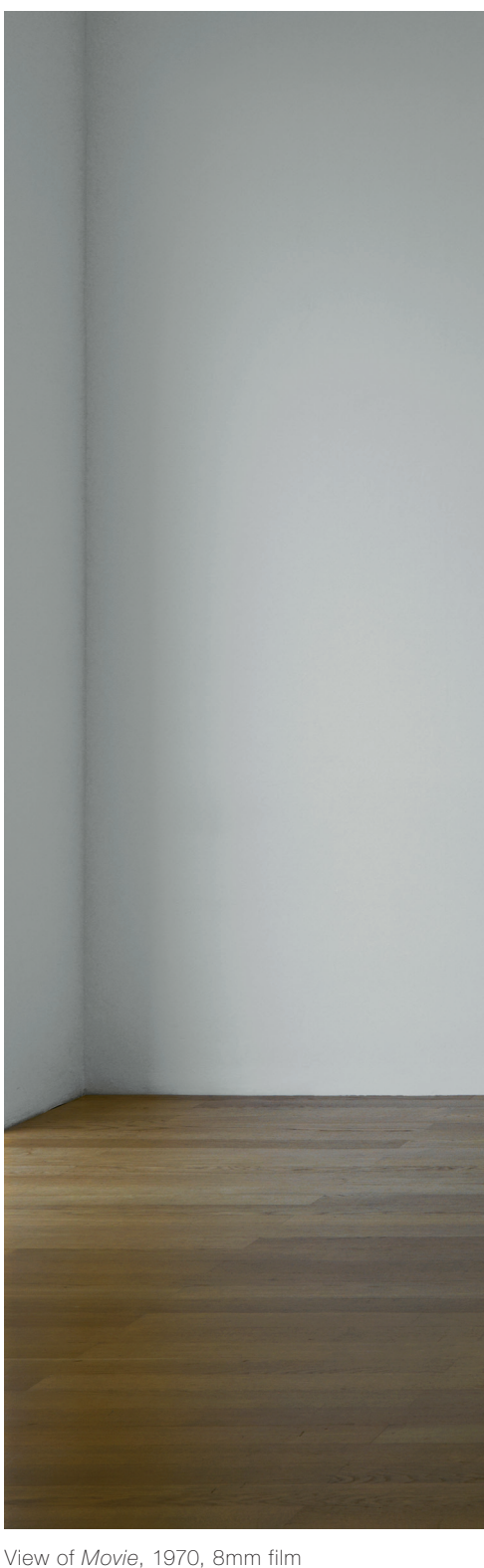
View of Movie , 1970, 8mm film transfered to DVD, 9 minutes. Collection MoMA, New York.

"Volkswagen Rope Pieces" (1968) is a series of 18 drawings on graph paper that were hung in the same room as the second Rope Piece (1967/2011), a radical sculpture consisting of two identical, upside-down, inclined Vs. Bollinger made the Vs by running identical lengths of manila rope up the wall and then down to and outward on the floor. The drawings were after-the-fact musings on the sculpture. The car manufacturer's trademark—another instance of Bollinger's gearheadness—is present in two of the drawings; others show increasingly complex combinations of line lengths and angles. The depicted figures alternately appear flat or sited in space, either