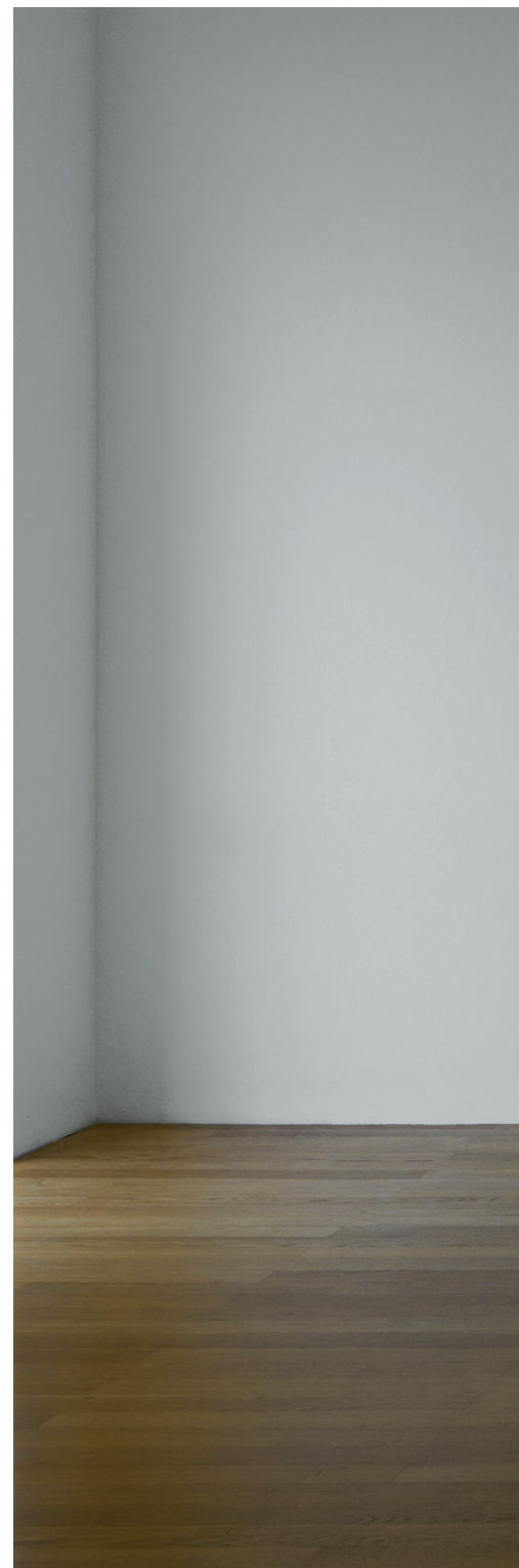
View of Movie , 1970, 8mm film transferred to DVD, 9 minutes. Collection MoMA, New York.

WADE SAUNDERS and ANNE ROCHETTE are sculptors who write about sculpture.